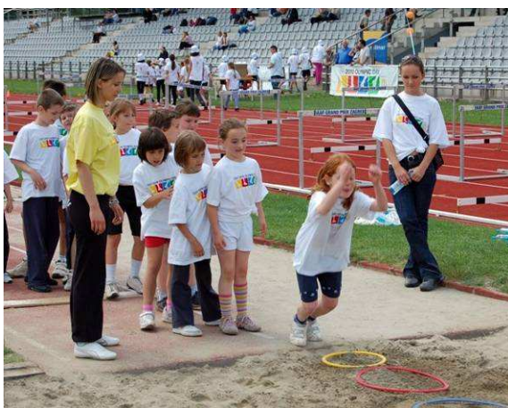
Introduction to long jump on Olympic Day in Zagreb